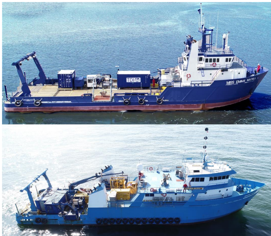
R/V Miss Emma McCall - LOA 153'; Call Sign: WDG8742; MMSI: 338100000 (top)